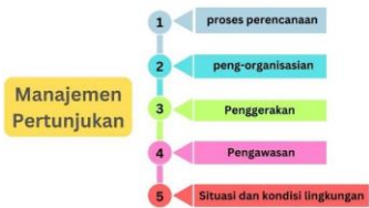
Figure 4. Management show