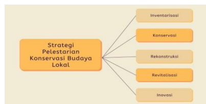
Figure 6. Strategic culture local.

The connection between community, management, and leadership cannot be separated, mutually bound, or related. Community as container, management, and leadership as tools for fulfilling needs as well as reaching objectives together. Community art shows can endure life and thrive, usually because of the tenacity and leadership carried out by the leader. Leadership is the ability to influence others to cooperate in accordance with a plan for achieving a goal. Leadership is connected to each other 'influence between leaders and followers (subordinates) who want real existence change that reflects the objective together. Various factor supporters in community art can influence successful performances, such as the management base, show patrons, players' supporters, and audience shows. Ironically, when entering the entertainment industry, factors Supporter the has commodified through the presence of television media, and is very related to problem commercial as well as the capitalist world. implemented through the ArtEdu application.