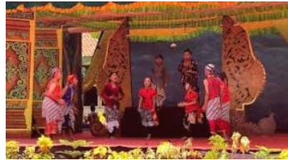
Figure 5. Ketoprak performance

be more progress and more known by people, not only in Indonesia, but worldwide (Wilson et al., 2023).