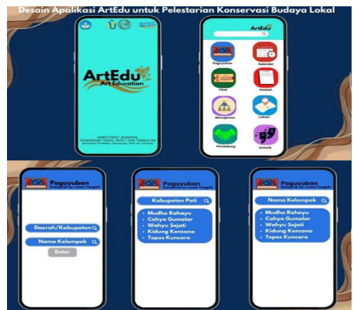
Figure 3. Design image application ArtEdu

field For overcome problem management leadership in each group art ketoprak. To ensure the best performance for the activist. In side marketing, creative strategies through social media and collaboration with local communities have become key to expanding the range. Information about timetable performances, history, scripts, artistic aspects, and sponsorship opportunities as well become part integral in serve experience show art Quality ketoprak for appreciators, and supports arts and culture Indonesia in a way wide (Fried, et al ., 2023)