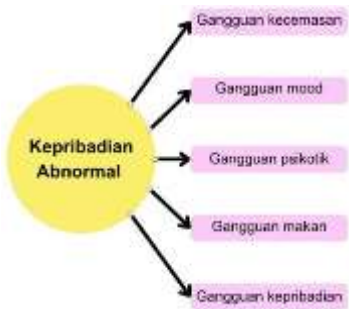
Figure 3. Abnormal personality

Disturbance personality divided become disturbance anxiety, mood, somatoform, paranoid, schizoid, schizotypal, avoidant, dependent, obsessive, narcissistic, antisocial, and histrionic.