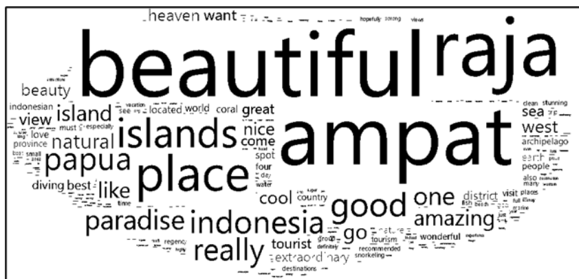
Figure 1. Word Cloud of Raja Ampat reviews

Natural Beauty. Key Terms: "beautiful" (96), "beautiful place" (12), "heaven on earth" (8), "natural beauty" (7), "paradise" (29), "amazing" (23), "natural" (22), "nature" (10), "wonderful" (10)