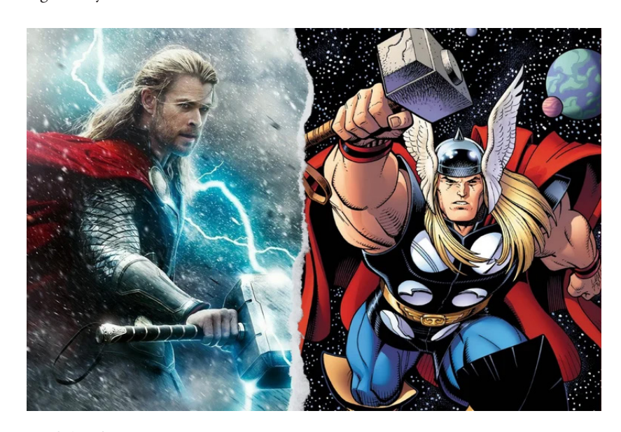
ILLUSTRATION 2. Design of Thor in Comics and Movies. (Infobae, 2021)

Q2. In what aspects does the movie depart from the original version of the story? As a continuation of the previous issue, it is interesting to know what the most notable differences are between both stories. Within this issue, it is important to clarify whether the differences are in terms of the plot or whether they focus on aspects such as characters or locations.