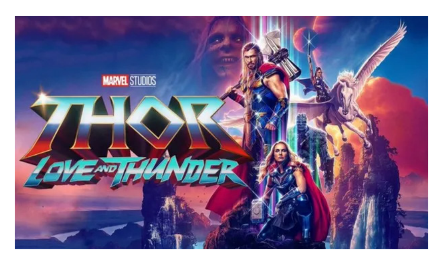
ILLUSTRATION 1. Thor: Love and Thunder Poster. (M1, 2022)

God Butcher (Aaron, 2018), we have a series of initial questions that can guide the research: