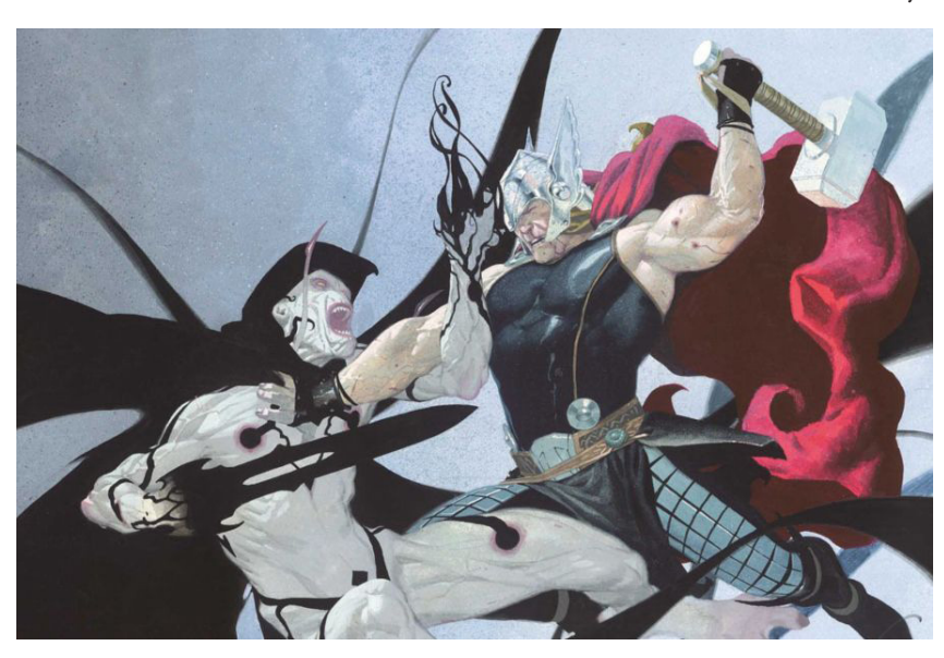
ILLUSTRATION 4. Duel Between Gorr and Thor. (Arros, 2022)

As we have demonstrated, Thor: Love and Thunder (Waititi, 2022) presents a series of differences that are significant enough to not consider it a faithful evolution. Not only does it